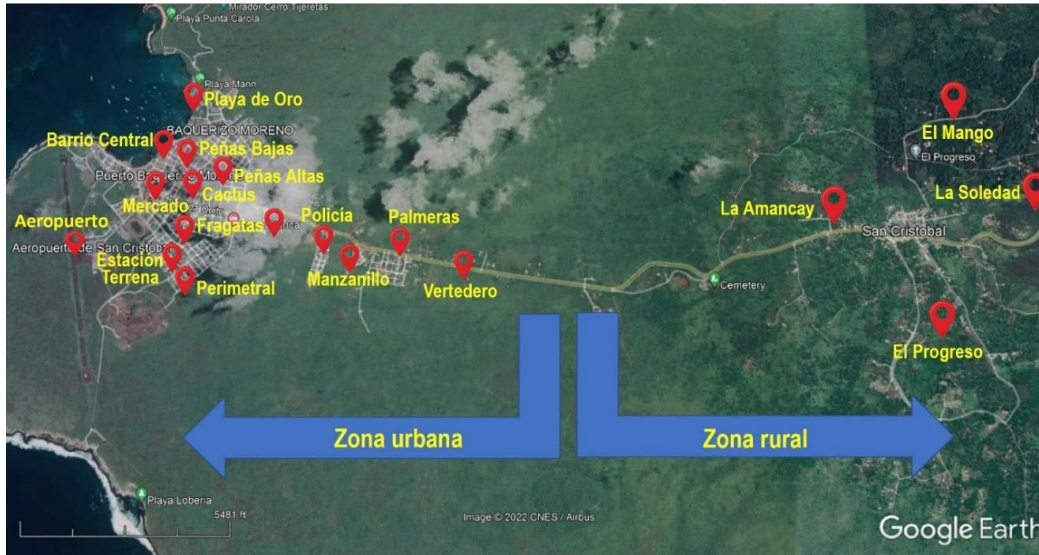
Figure 1. Distribution of feral cat capture sites on San Cristobal Island, Galapagos province, Ecuador.

The study was carried out in the province of Galapagos, in San Cristobal town, San Cristobal Island. Eighteen points located in the urban area (14 locations) and the rural area (4 locations) of the island were sampled according to Figure 1.